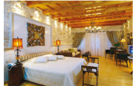
Avli Lounge, Rethymnon Old Town, Crete