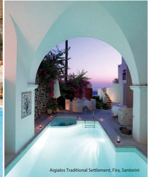
Aigialos Traditional Settlement, Fira, Santorini