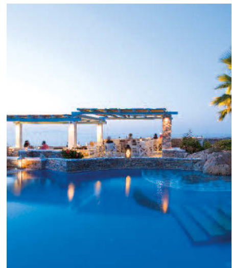
Anemomilos, Chora, Folegandros, Western Cyclades