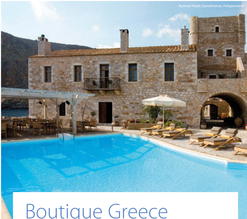
Kyrimai Hotel, Gerolimenas, Peloponnese